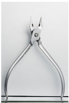
5 Straight Utility Plier(How Style)