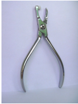
3 Convertible Cap Remover