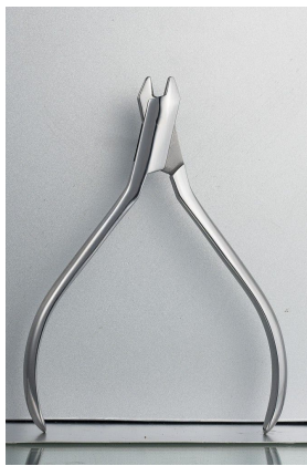
20 Lingual Arch Forming Plier OIP-119