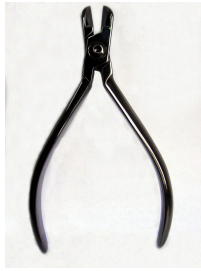
3 Mini Pin and Ligature Cutter OIC-102