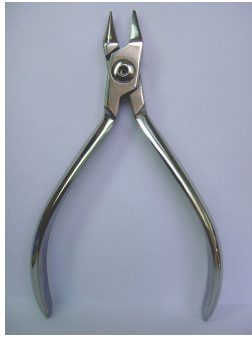
2 Bird Beak Plier Black