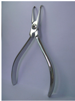
7 Utility Plier (Weingart Style, Slim Tips) OIP-106