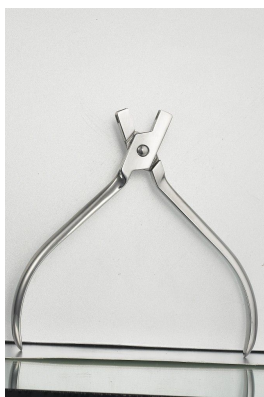
5 Rectangular Arch Forming Plier with one side OIF-104