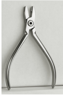
13 Nance Loop Forming Plier