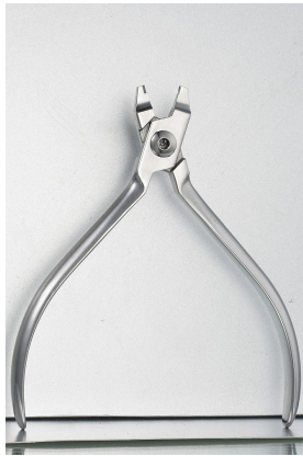
4 Rectangular Arch Forming OIF-103