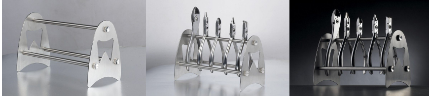
2 Plier Organizer simple style