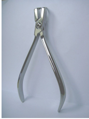
16 Detailing Step Plier OIP-115