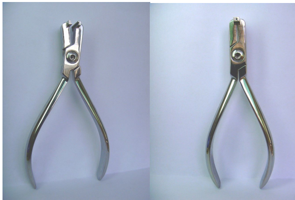
17 Distal Ending Bender NiTi OIP-116