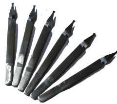
1 Direct Bond Tweezer HID-100