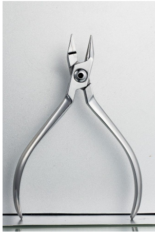
22 Utility Plier with Cutter