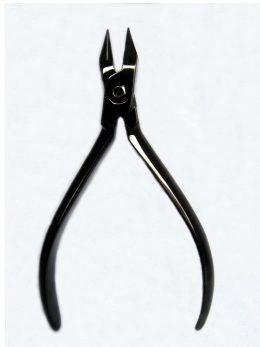
3 Light Wire Plier