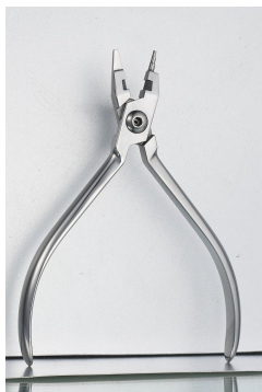
11 Loop Forming Plier(Tweed Style)