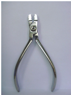
21 Optical Style Plier OIP-120