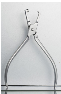
2 Posterior Band Remover Enhanced