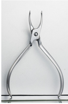
6 Straight Utility Plier(How Style, Small Tips) OIP-105