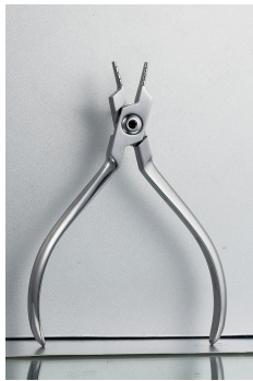
14 Hollow Chop