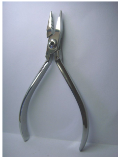
10 Kim Plier