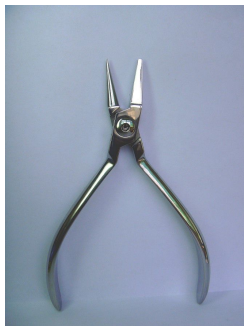
4 Bird Beak Plier with Cutter