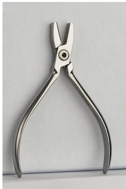
15 Cinch Back Plier