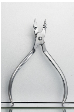
12 Stop (V-Bend) Plier