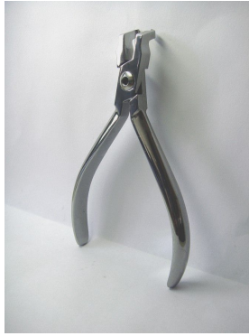
3 Adhesive Remover