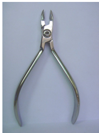
4 Heavy Duty Cutter OIC-103