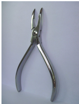
8 Three-Jaw Plier(Straight) OIP-107