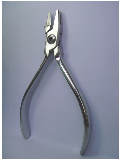
9 Jarabak Plier