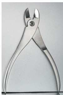
5 Distal End Cutter OIC-105