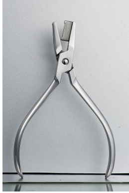
19 Hollow Chop Arch Forming Plier OIP-118